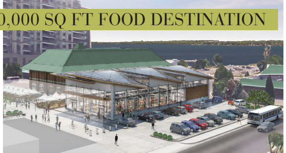
NEW DOWNTOWN PUBLIC MARKET