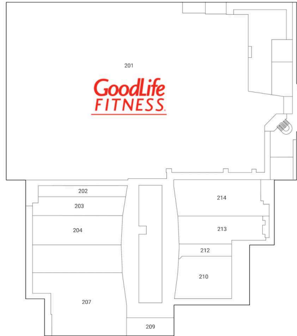
Office Galleria 2nd Floor